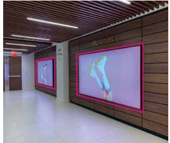
Light Box Graphic Example