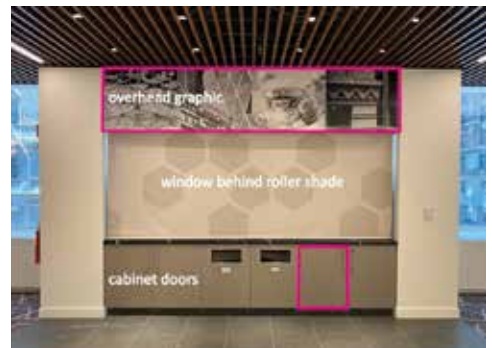
Coffee Station Example 2