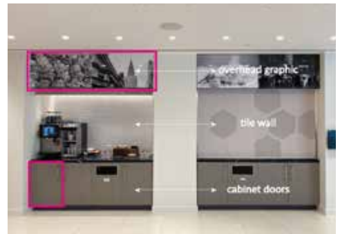
Coffee Station Example